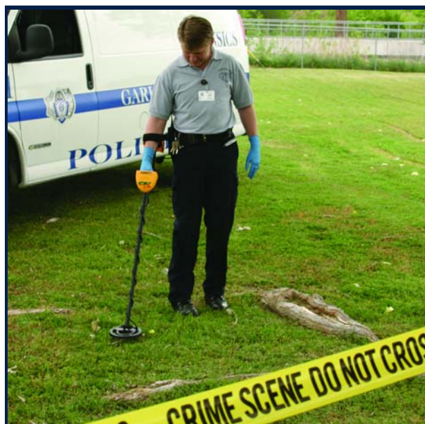
1554900.A.0705 ©2005 Garrett Electronics, Inc.